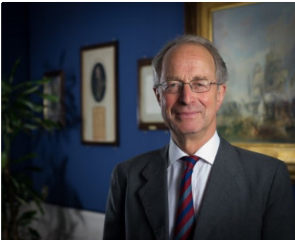
General the Lord Richards of Herstmonceux GCB CBE DSO Non-Executive Chairman